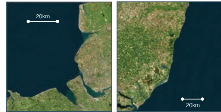
a) Liverpool Bay b) Suffolk Coast