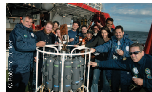
The last CTD of the 2004 Antarctic cruise in one of the most productive regions of the world's oceans.