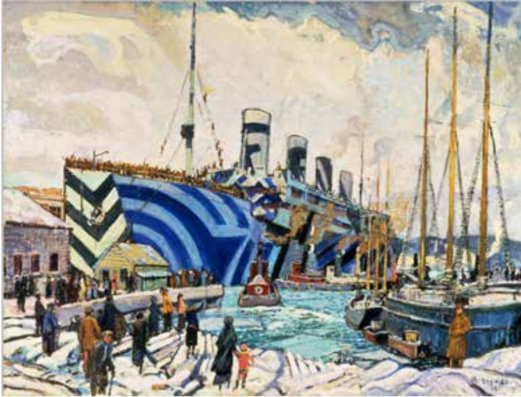
'Olympic with Returned Soldiers' by Arthur Lismer (1919)