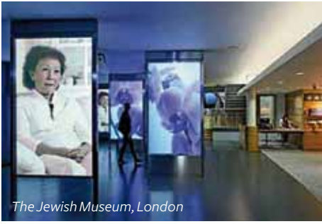
The Jewish Museum, London