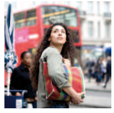
Monday 29 to Wednesday 31 October

From Monday 29 to Wednesday 31 October at 19:30 at The Nuffield Theatre Studio you can see Juana in a Million .